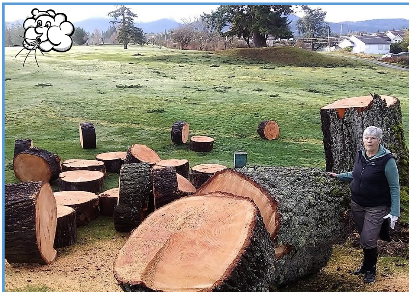
Sue Barber with course clean up after the winds across the peninsula. Looks like great firewood!!

Wishing all of our PGC members a Happy New Year with many golf outings on your 2019 schedule!